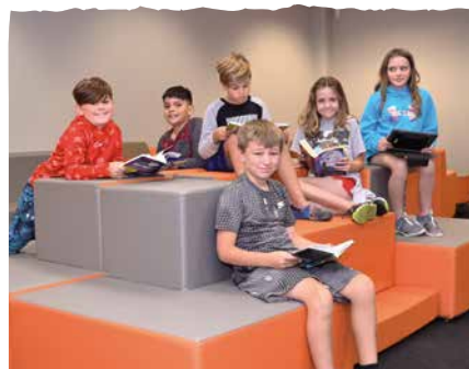
Olive Elementary Computer Lab now has New Modern Kid-Friendly Furniture