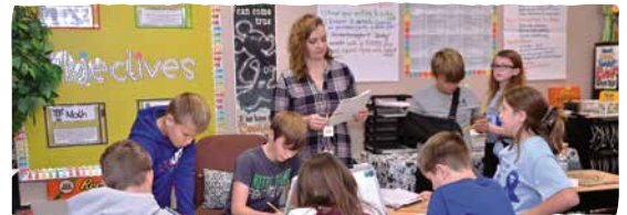
Teacher Training in a Writing Program at Prairie View Elementary