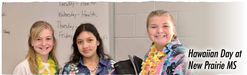
Hawaiian Day at New Prairie MS