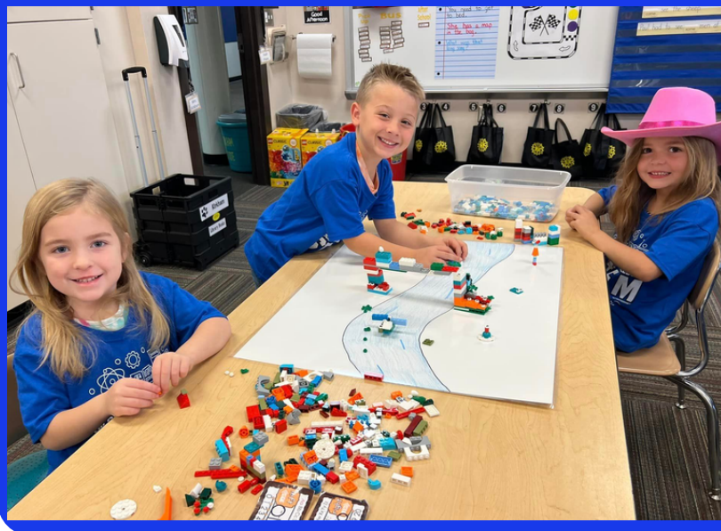
Lego Bridge Building Challenge