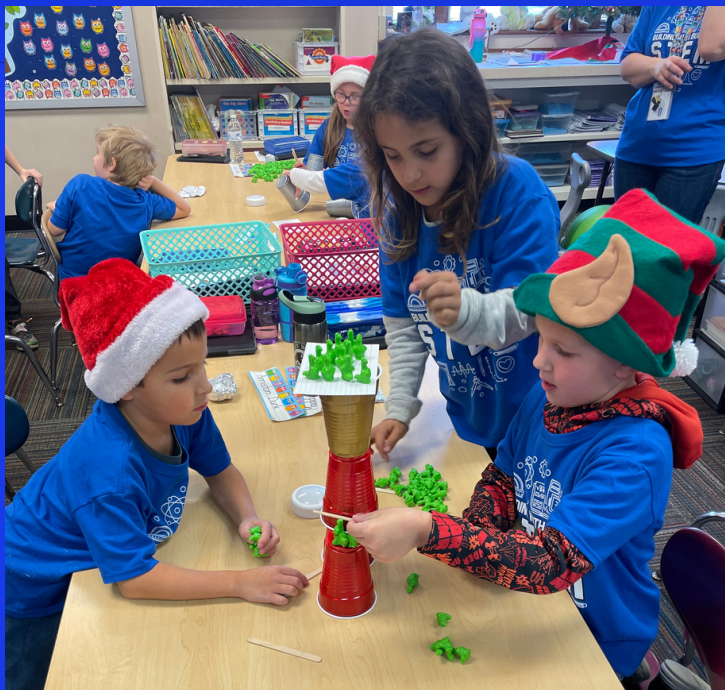
The Floor is Lava!