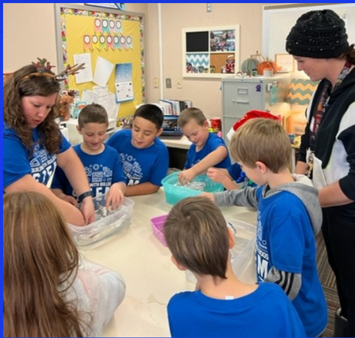
Build a Boat