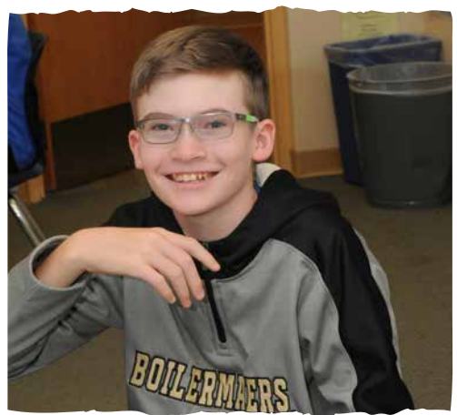
Our mission is to ensure high levels of learning for all students.