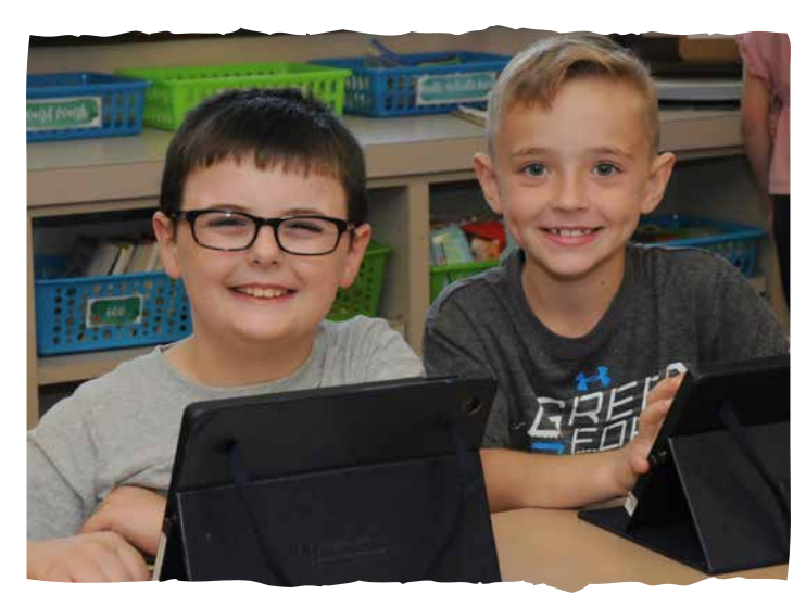
Technology plays an important role in the education of our students.