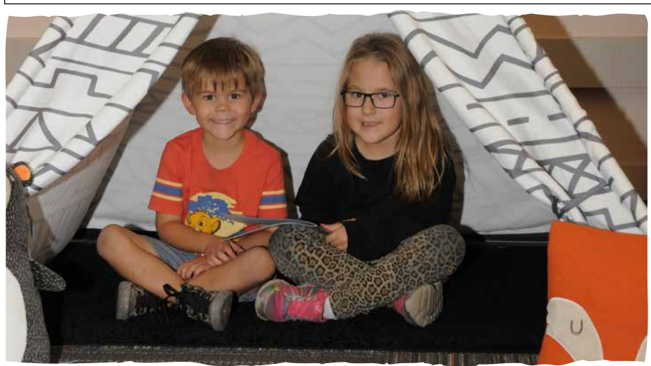
Learning is more fun with friends!