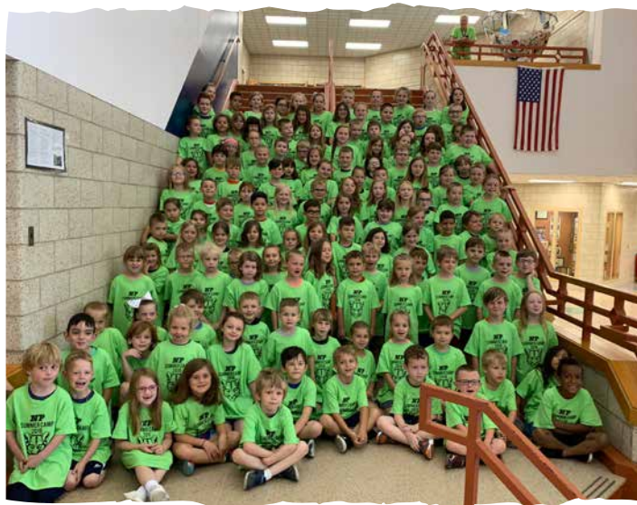
The Healthcare Foundation of La Porte awarded NPUISC $125,582.00 to sustain its elementary afterschool programming, Empower Hour.