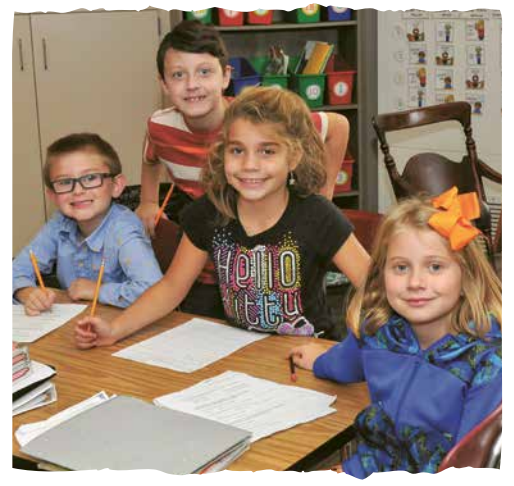
There is something to smile about at New Prairie!