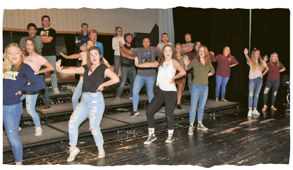
Students at New Prairie not only excel academically, they also excel in extra-curriculars.