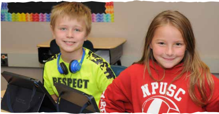
There is something to smile about at New Prairie schools!