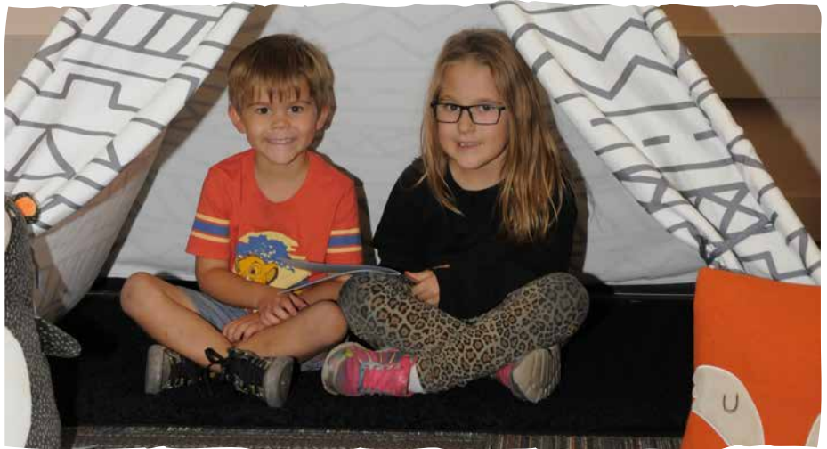
Learning is more fun with friends!