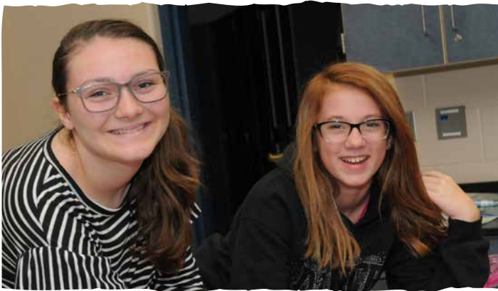
We are thankful for all of our wonderful students at New Prairie.