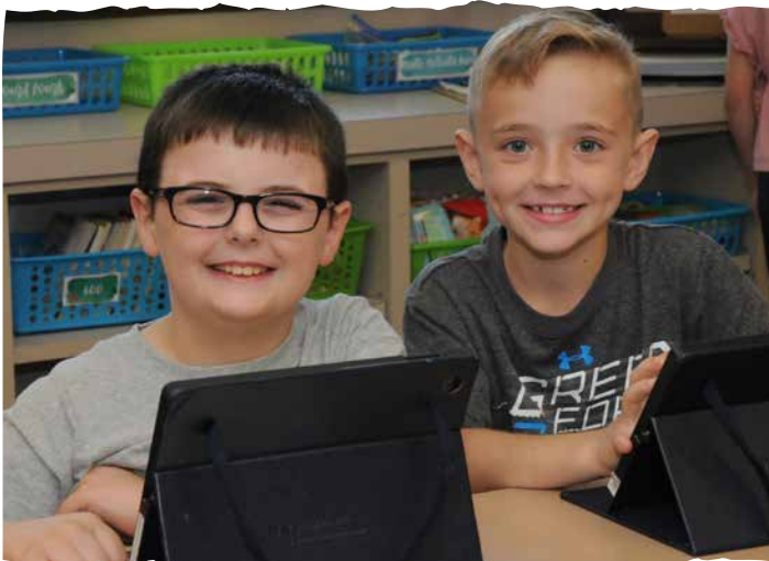
Technology plays an important role in the education of our students.