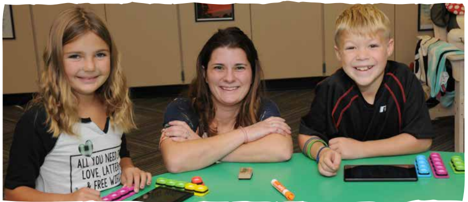
We are proud of our wonderful teachers and students here at New Prairie.