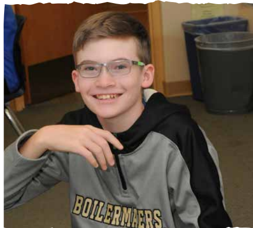
Our mission is to ensure high levels of learning for all students.